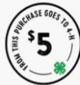
Classic Tall 4-H Women's Waterproof Insulated Boots