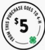
Classic Tall 4-H Men's Insulated Waterproof Boots